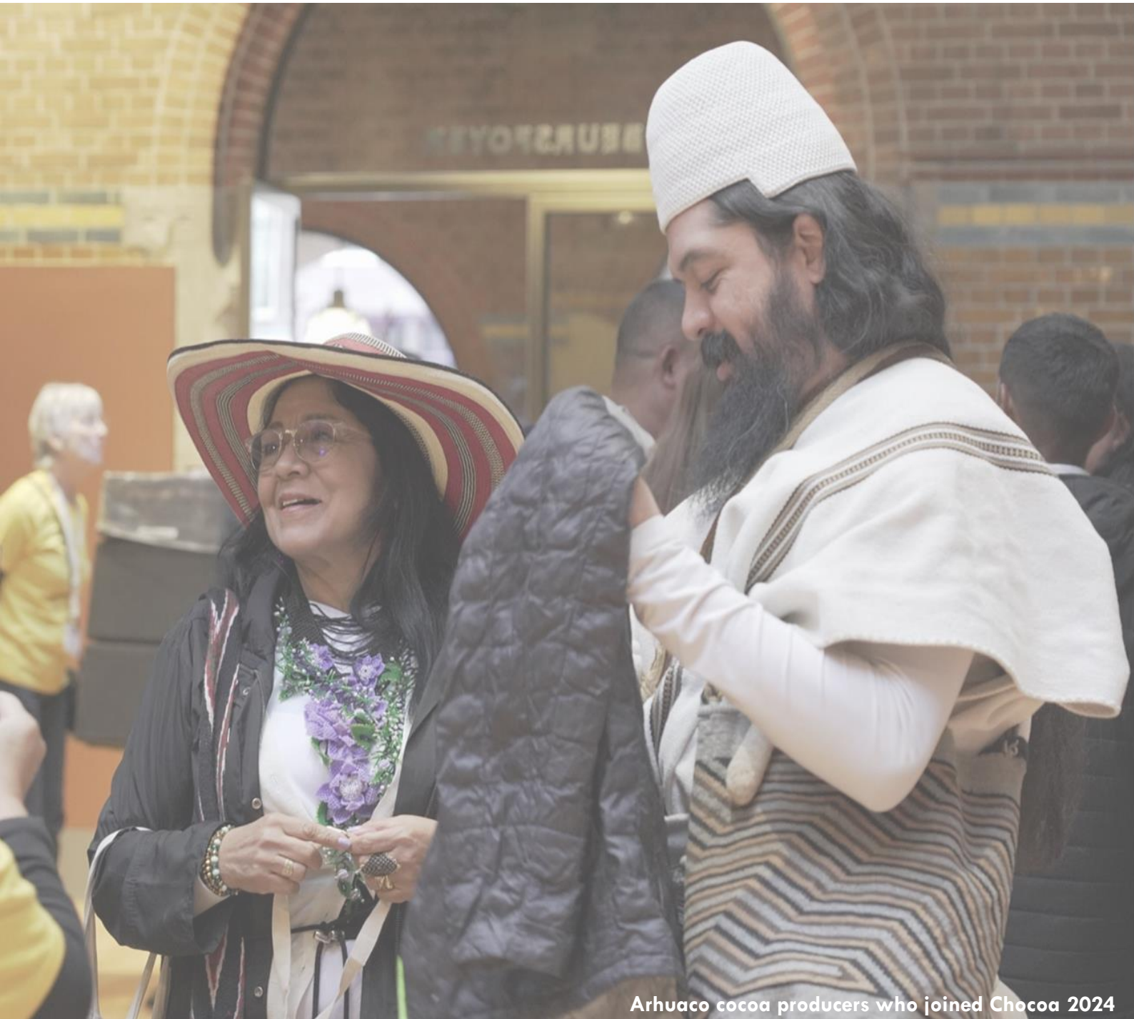
Arhuaco cocoa producers who joined Chocoo 2024